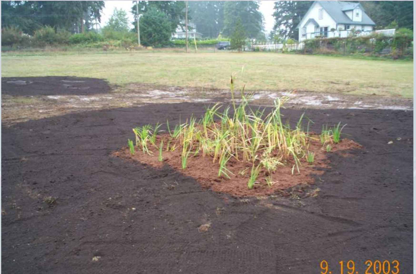
VTF at planting in 2003