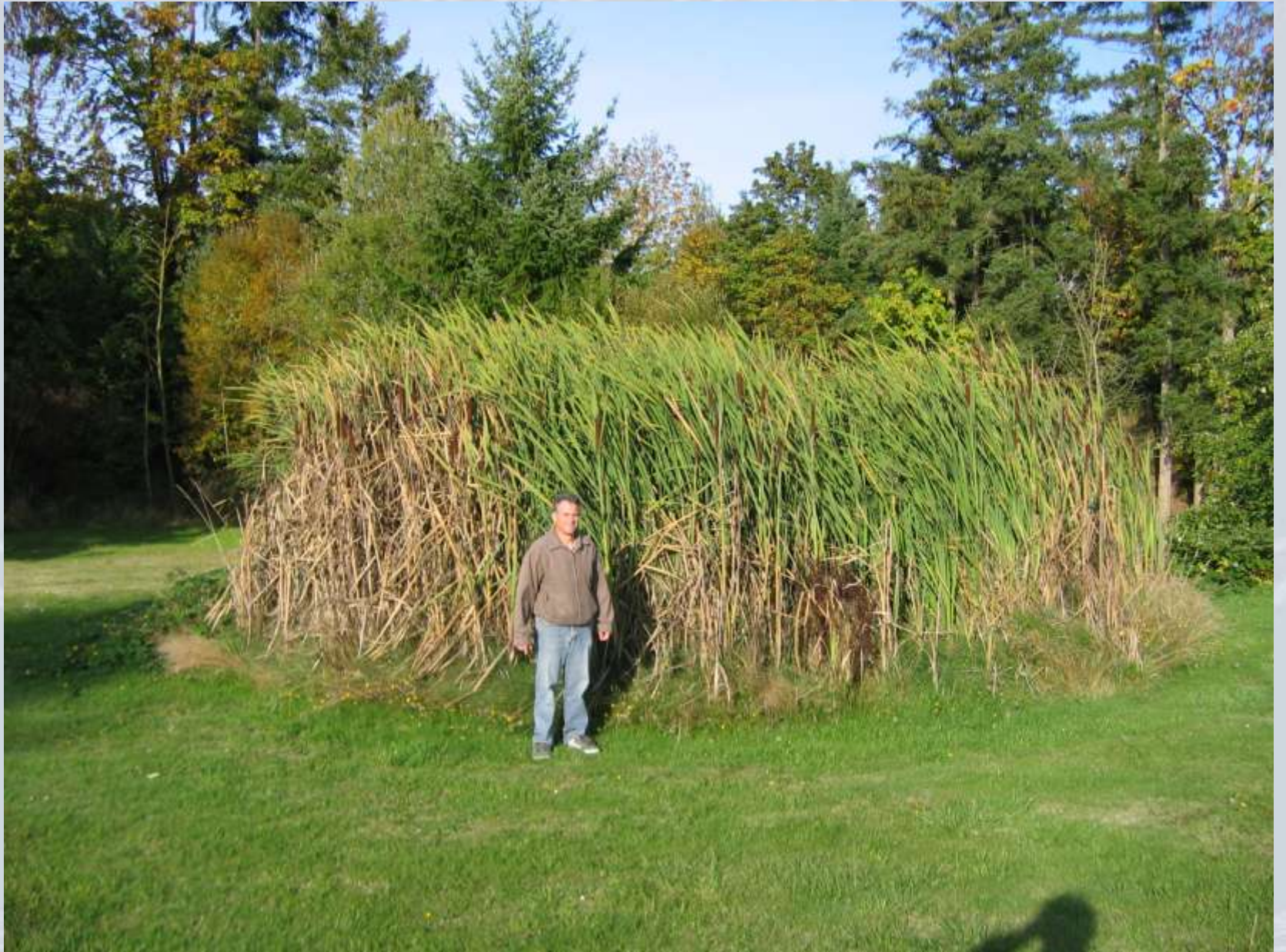
VTF in 2007