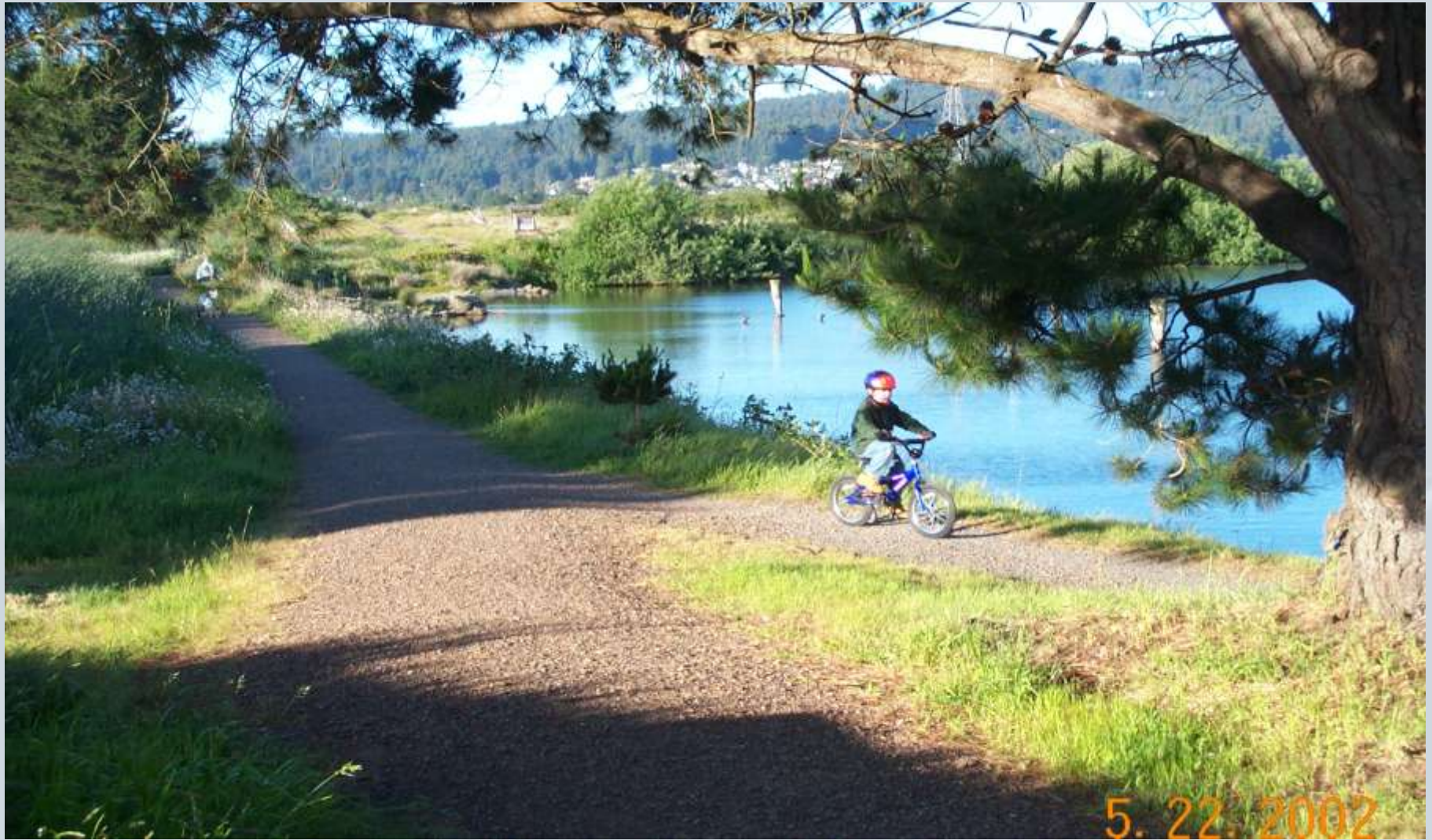
A young visitor